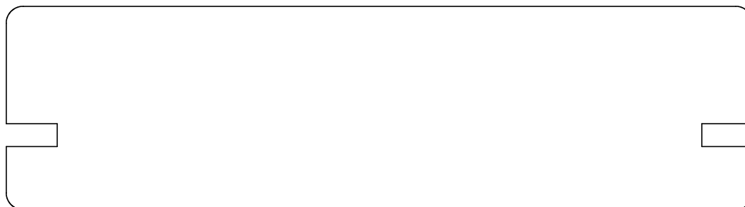
GROOVE & GROOVE

Lumberock® is a wholly owned subsidiary of CMI Limited Co. Visit cmilc.com/legal for more information on referenced trademarks and patents owned by CMI Limited Co.