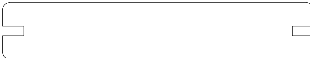
GROOVE & GROOVE

Lumberock® is a wholly owned subsidiary of CMI Limited Co. Visit cmilc.com/legal for more information on referenced trademarks and patents owned by CMI Limited Co.